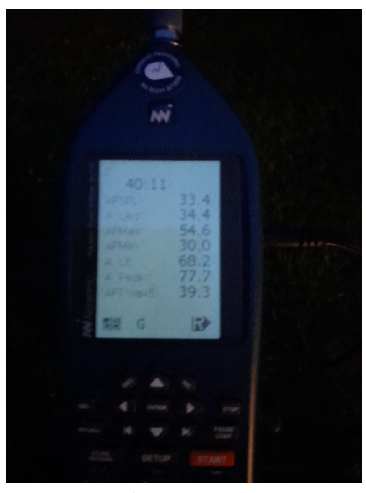
Committee \ is \ asked \ to \ consider \ the \ following \ noise \ impact \ assessment